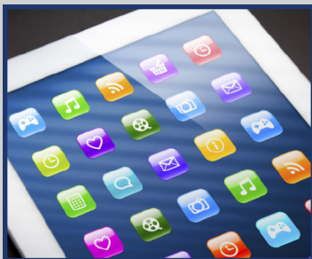
Digital Tablet Displaying Apps