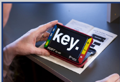
Portable Magnification Device