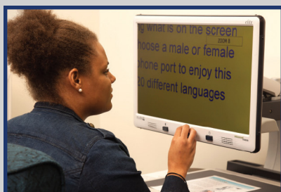
Desktop Video Magnifier