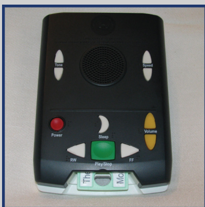
Talking Book Machine