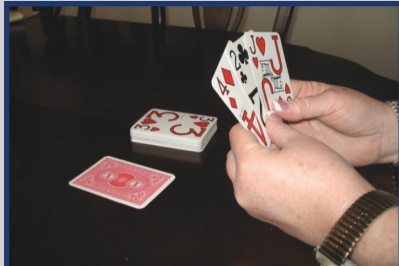
Large-Print Playing Cards